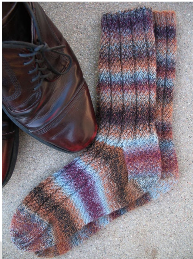
A pair of Gentleman socks knit from Trekking XXL color 101. They feature a textured rib that makes it enjoyable to knit for you while not fighting with the subtle color variations in the yarn.

To achieve the texture on the ribs there are traveling stitches that reduce the stretchiness of the rib slightly. You may find that you need to move up one size from your usual stitch count in order to get the sock over your heel. Or, start with needles one size larger for the top 2-3 inches.